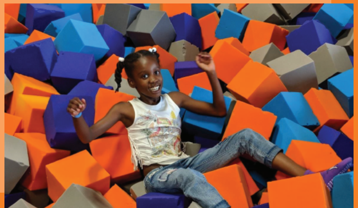
One of the Project Renewal kids having a blast during one of the several field trips this year.