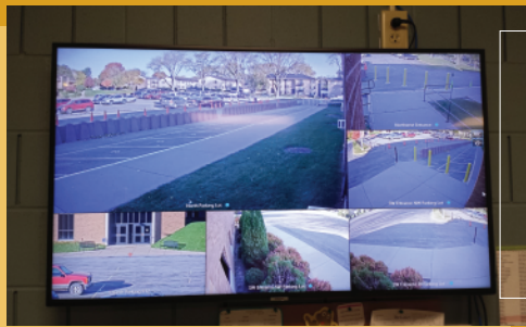
View of JFK's parking lot from new security cameras.