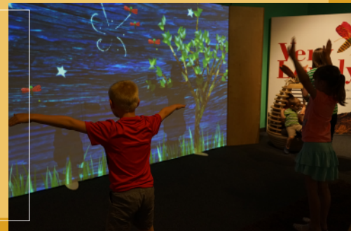
Family Museum visitors using digital technology to attract and fly with firefly friends within the Very Eric Carle exhibit.