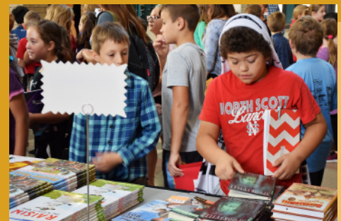
Students attending the 2018 Children's Literature Festival buying books at the book fair.