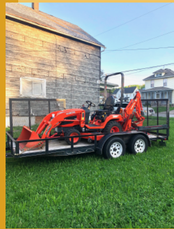
One Eighty's grounds equipment, tractor and trailer.