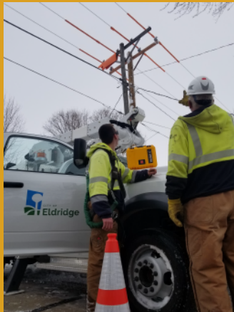
City of Eldridge utility workers with Automated Emergency Defibrillators (AED's) installed in their trucks.